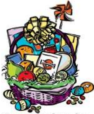
Easter Baskets for Covenant to Care

Thank you to everyone who has signed up to provide a basket of food and gift cards for families of Covenant to Care.